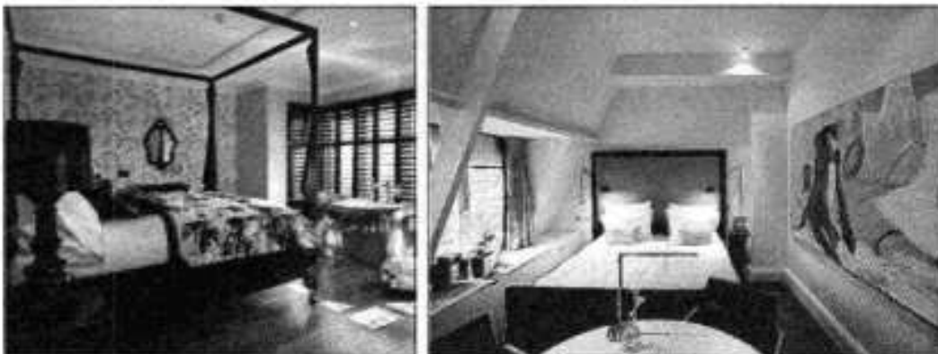
Take your pick: cosy yet eccentric at Holm House. Right, modern touches at the historic Roemer